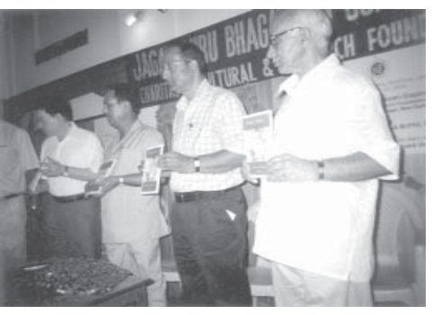
The book is released