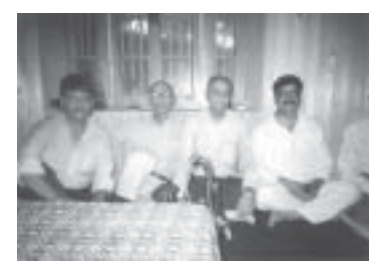
Office bearers and devotees