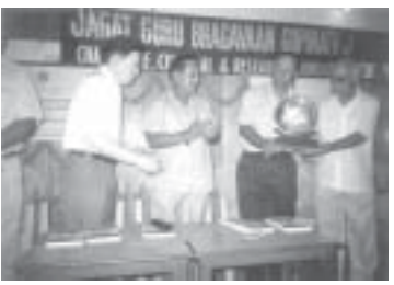
Presentation of the Memento