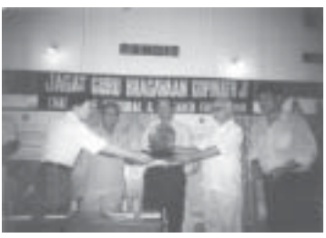
Presentation of the Memento